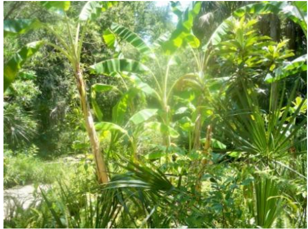
Vietnam Memorial Site Background