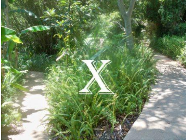
Vietnam Memorial Site